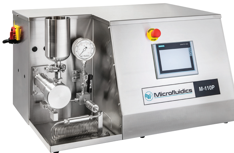
Model shown is subject to change depending on options selected.